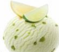
LEMON & LIME SORBET